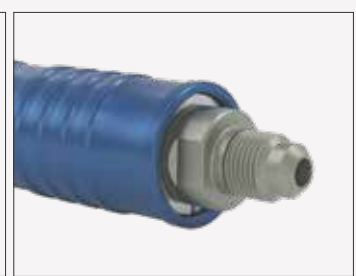
90° media inlet