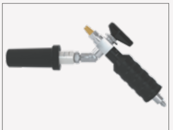
WEH® TK10 CNG without gas recirculation, grip position 45°