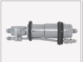
WEH® TSA2 CNG with gas recirculation