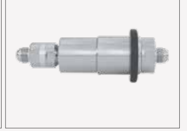
WEH® TSA6 CNG without gas recirculation