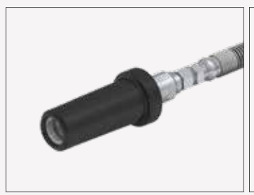
WEH® TK4 CNG fueling nozzle