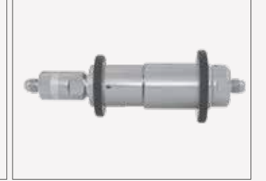
WEH® TSA2 CNG without gas recirculation