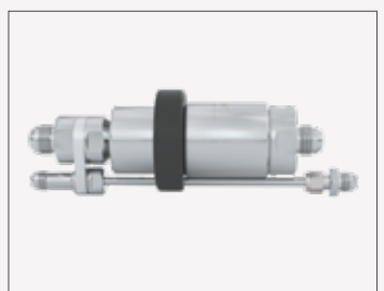
WEH® TSA6 CNG with gas recirculation