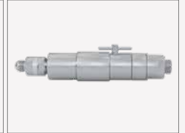
WEH® TSA5 CNG without gas recirculation