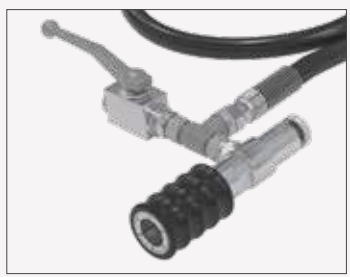
WEH® TK21 CNG service nozzle