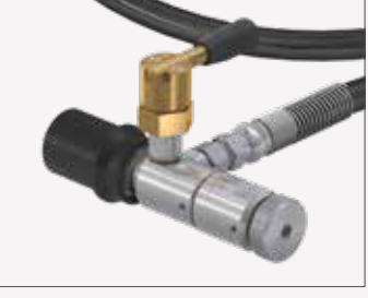
WEH® TK6 CNG service nozzle