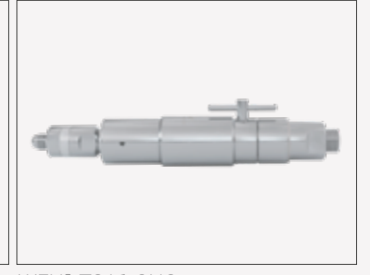
WEH® TSA1 CNG without gas recirculation