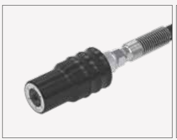
WEH® TK22 CNG fueling nozzle